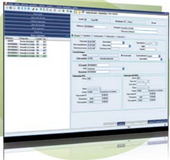
Assets depreciated according to different amortisations plans, bought or contracted in direct financing leases.

New legal regulations are added using a simple update system: optimise your accounts and IT teams.